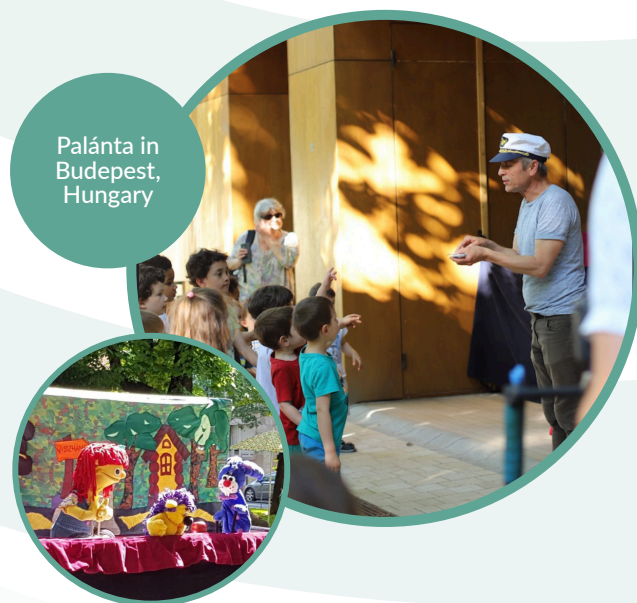
Palánta in Budepest, Hungary

ones. Palánta encouraged the recipients to share the gift of these Bibles with their grandchildren and great-grandchildren by reading together, or even giving the books to family members as a gift when the lockdown lifted. After the availability of the books were made known, more than 2,000 Bibles were requested and distributed for this use!