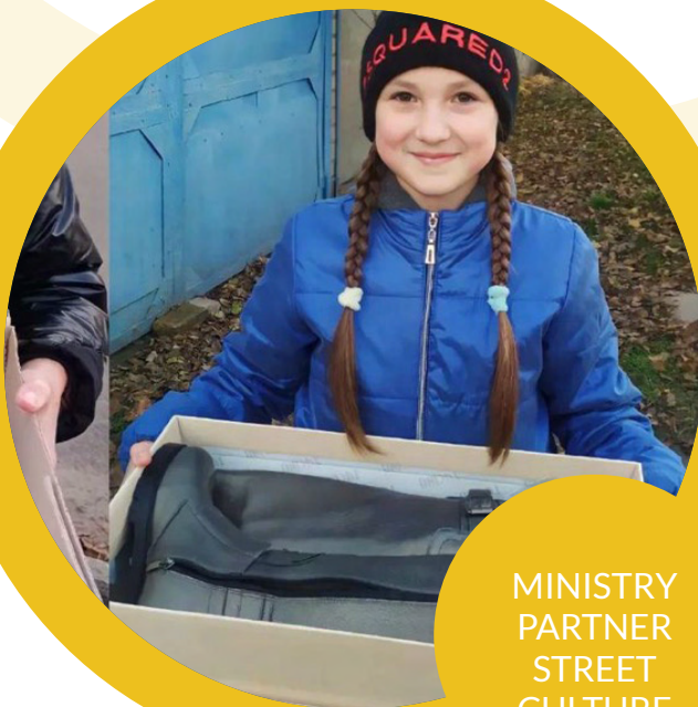
MINISTRY PARTNER STREET CULTURE