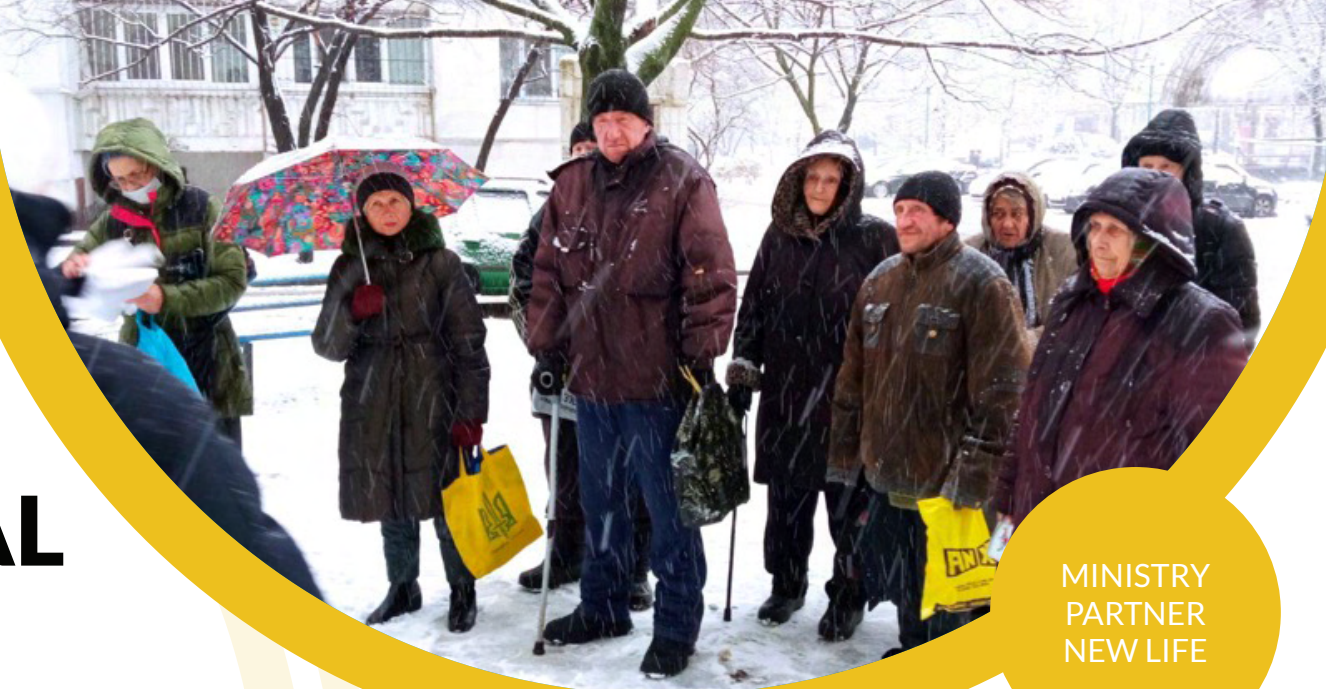
MINISTRY PARTNER NEW LIFE

If we can do the same, we can prove the admonition from Ecclesiastes 4:12: "Though one may be overpowered, two can defend themselves. A cord of three strands is not quickly broken." It's more than encouraging – it's outcome changing – that we stand in unity with the God of the universe Himself as the third strand in the cord uniting believers around the world, "that they may be one, as we are one" (John 17:22).